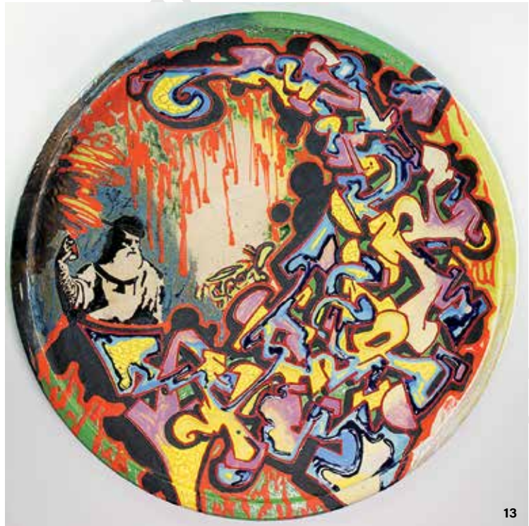
12 Hakyong Kim's Canvas on the Table Series , to 18 in. (46 cm) in width, stoneware, fired to cone 6 in oxidation, 2020. 13 Justin Gerace's Stay Studying 120 , 24 in. (61 cm) in height, stoneware, fired to cone 6 in oxidation, 2017.