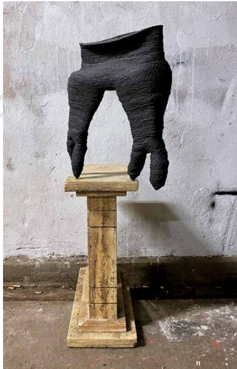
10 Takuro Shibata's untitled, 20 in. (51 cm) in height, North Carolina local clays, iron oxide, wood fired to cone 11, 2021. 11 Eyvind Solli Andreassen's Fire Bein (Four Legs) , 16 in. (41 cm) in height, black porcelain, fired to 2264°F (1240°C), 2021.