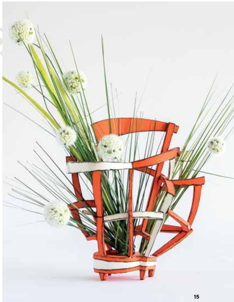
14 Tyler Quintin's Rendering Connection , 21 in. (53 cm) in height, stoneware, porcelain, underglaze, glaze, fired to cone 5 in oxidation, steel pipe, wood panel, 2021. 15 Nikki Blair's Large Orange Basket/Cage , 15 in. (38 cm) in height, handbuilt earthenware, fired to cone 04 in oxidation, 2021.