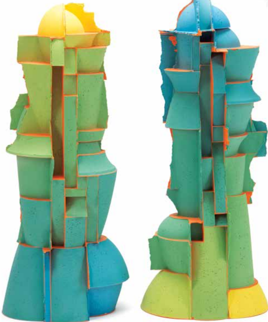
3 Hannah Scrima's Chartreuse Vase , 5½ in. (14 cm) in height, stoneware, underglaze, fired to cone 5, 2021. 4 Kyle Johns' Reverse Fade Structures , 25 in. (64 cm) in height, colored porcelain, fired to cone 6 in oxidation, 2021.