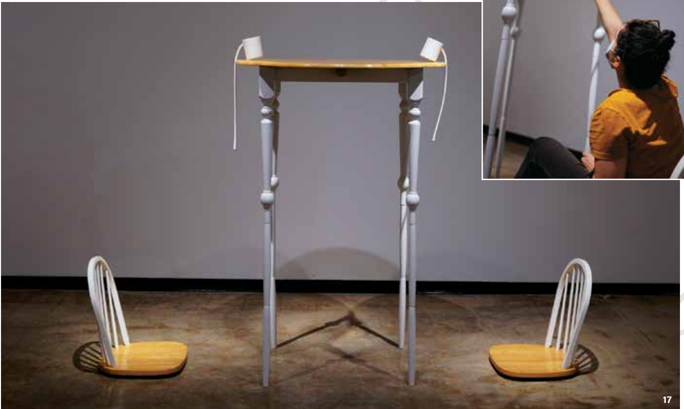
16 Ashwini Bhat's The Beginning is the End is the Beginning 01 , 8 in. (20 cm) in diameter, handbuilt stoneware, underglaze, glaze, fired to cone 6 in oxidation, paint, 2019. 17 Claire Lenahan's Precarious , wheel-thrown porcelain, fired to cone 6 in oxidation, found-and-altered wood table and chairs, 2021. 18 Claire Lenahan's Precarious (detail of viewer interaction).