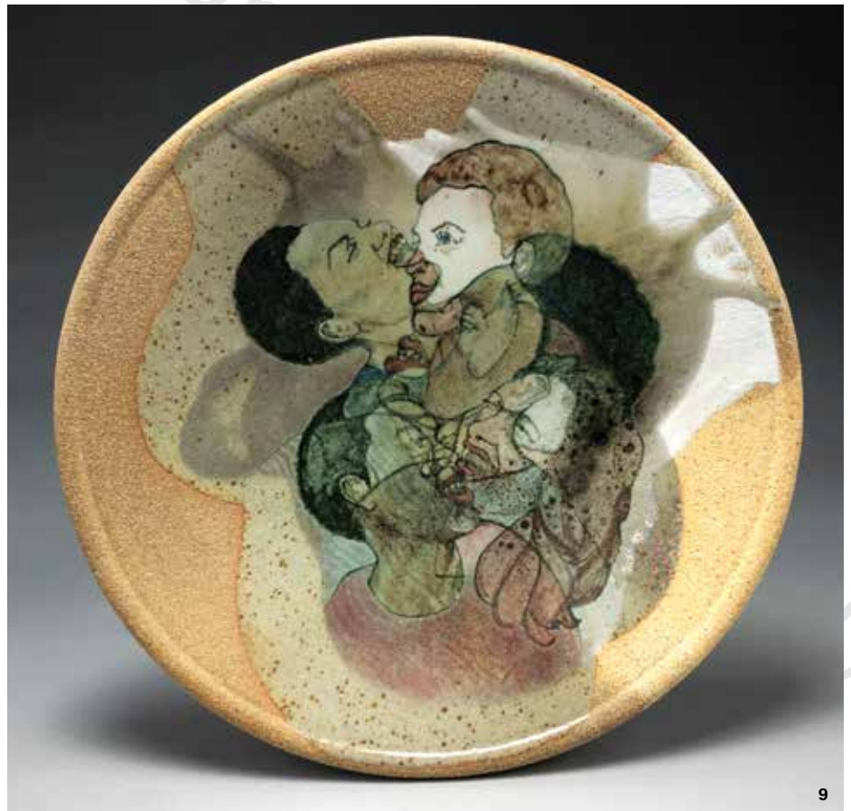
8 Mark Goudy's Shell Series Object #1229 , 19 in. (48 cm) in length, translucent porcelain, fired to cone 5 in oxidation, 2021. 9 Jennifer Graff's Rejoice (serving bowl) , 11 in. (28 cm) in height, stoneware, white slip, underglaze, fired to cone 7 in reduction, 2021.